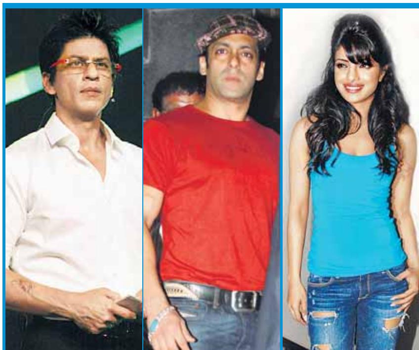
TWEET NOTHINGS: (L-R) Shah Rukh Khan, Salman Khan and Priyanka Chopra