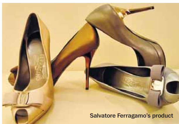
Salvatore Ferragamo's product