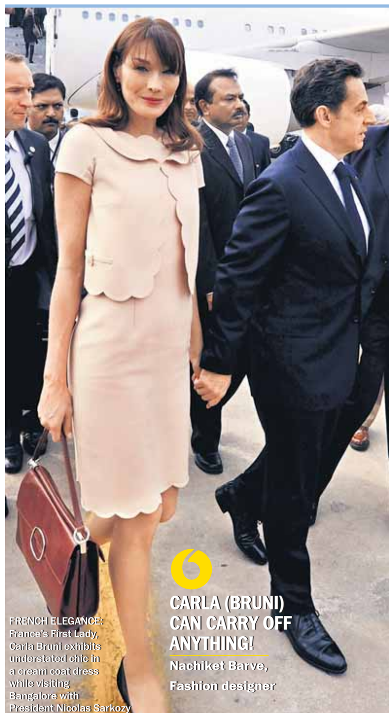
FRENCH ELEGANCE: France's First Lady, Carla Bruni exhibits understated chic in a cream coat dress while visiting Bangalore with President Nicolas Sarkozy