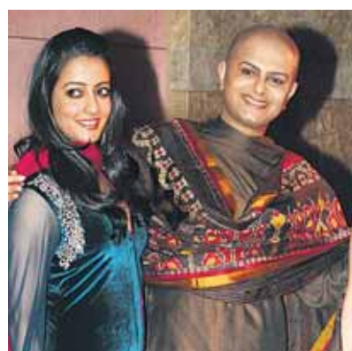
SHOW OF SOLIDARITY: (Clockwise) Raima Sen with Rituparno Ghosh, Juhi Chawla, Rahul Bose and Vishal Bharadwaj

"We have scheduled live interactions between the actors, filmmakers and