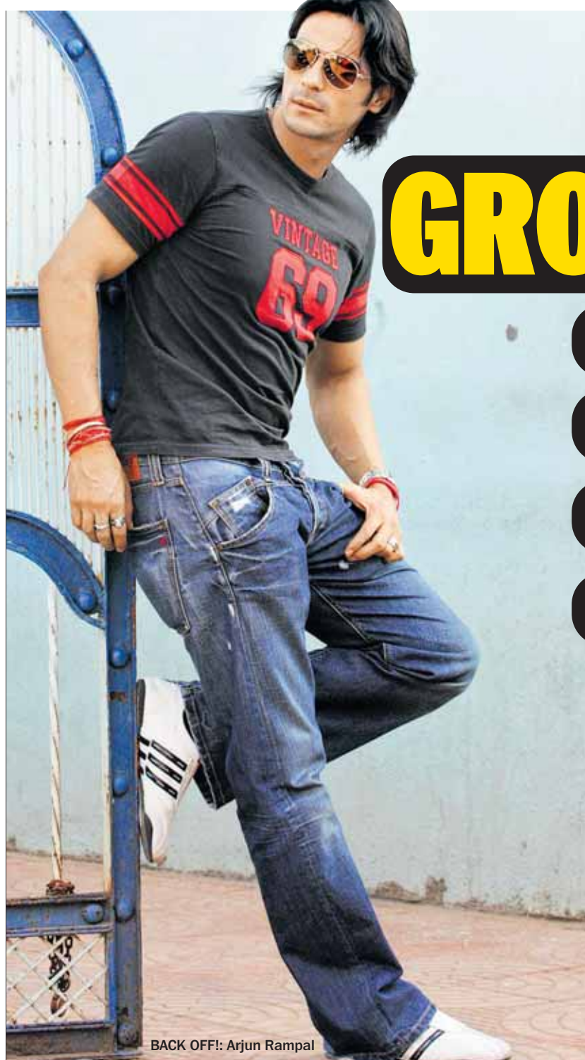
BACK OFF!: Arjun Rampal

Actor Arjun Rampal had to return to Breach Candy Hospital yesterday after his earlier discharge because his back injury got aggravated