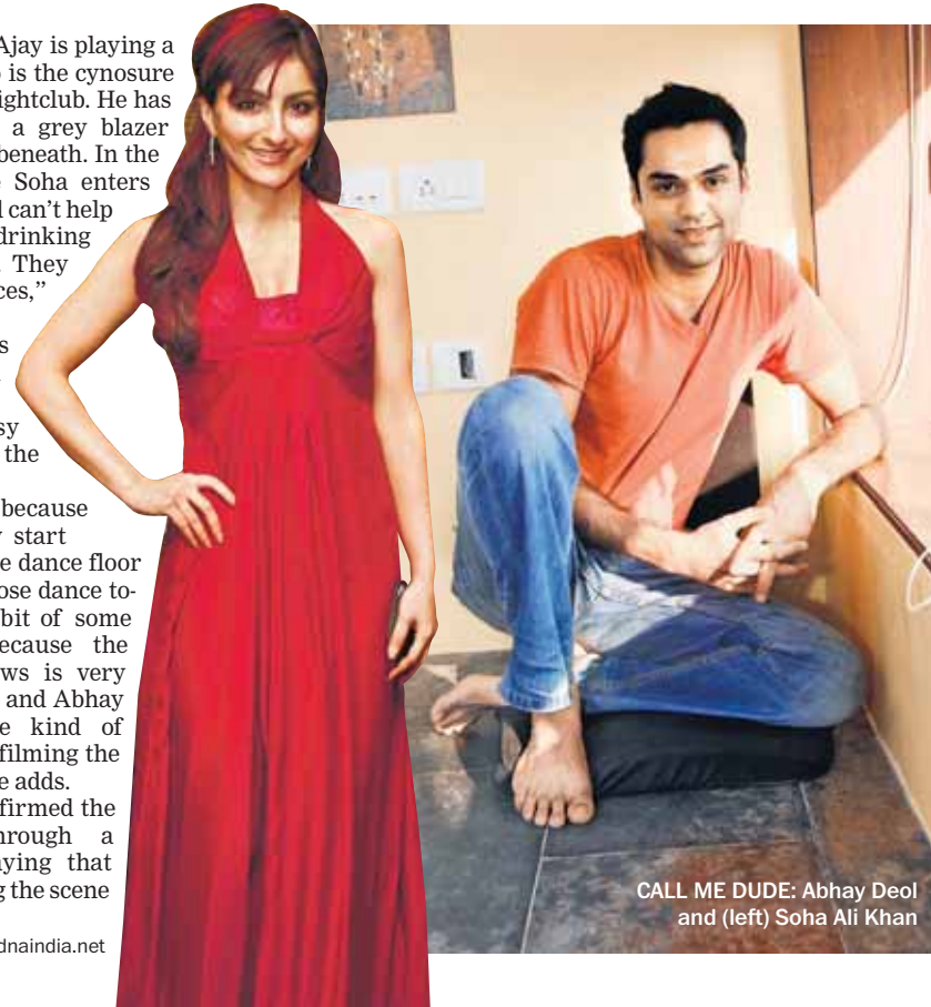
CALL ME DUDE: Abhay Deol and (left) Soha Ali Khan