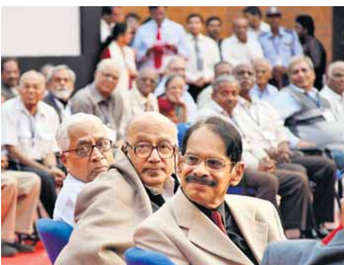
Former IIMAites on the stage